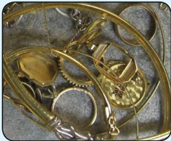
Santa Fe, NM