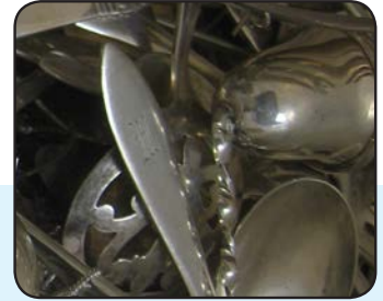
Morehead City, NC