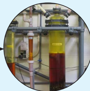
Green Refining Process