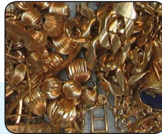
New York, NY